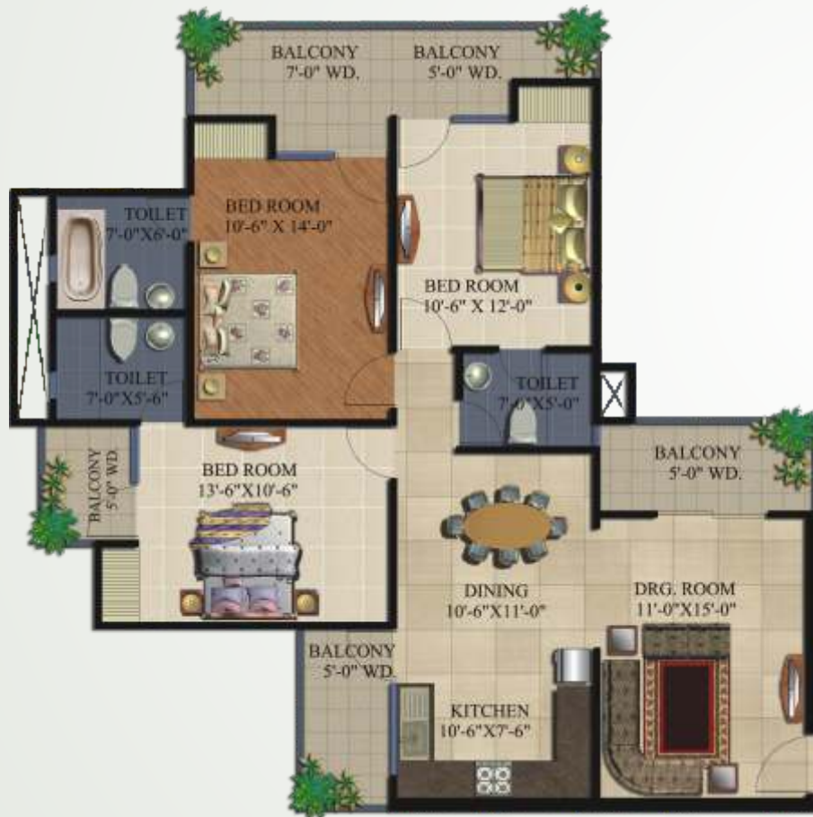
3 Bedrooms with 3 Toilets Super Area - 1595 Sq. Ft. | Flat No. 1, 2