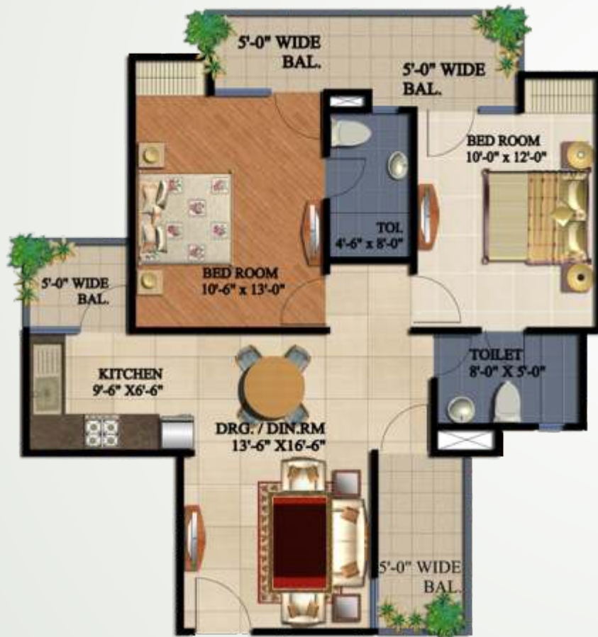
2 Bedroom Flat Super Area - 1075 Sq. Ft. | Flat No. 4