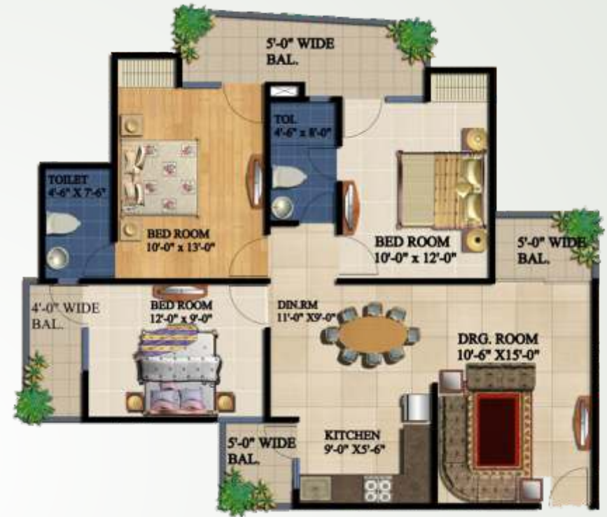
3 Bedroom Flat Super Area - 1295 Sq. Ft. | Flat No. 1, 2, 3,