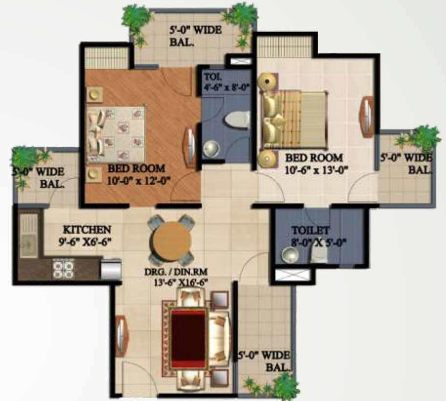
2 Bedroom Flat Super Area - 1075 Sq. Ft. | Flat No. 5, 6