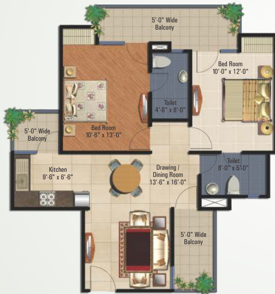
2 Bedroom Flat | Super Area - 1075 Sq. Ft. | Flat No. 4