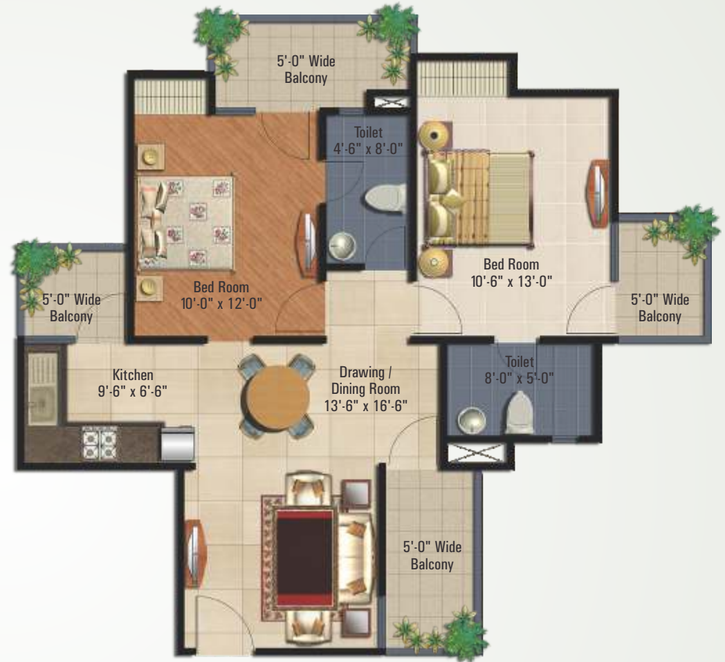
2 Bedroom Flat | Super Area - 1075 Sq. Ft. | Flat No. 5, 6