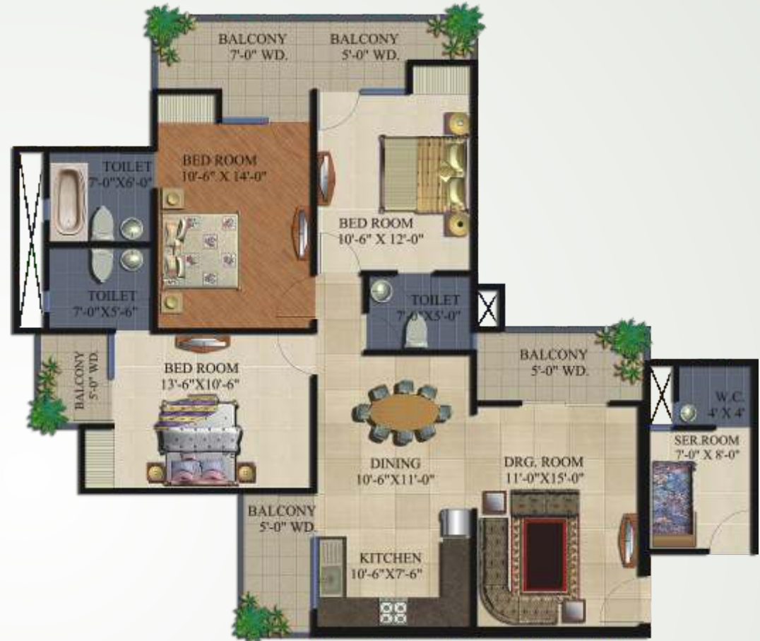
3 Bedrooms with 3 Toilets and Servant Room Super Area - 1750 Sq. Ft. | Flat No. 3, 4