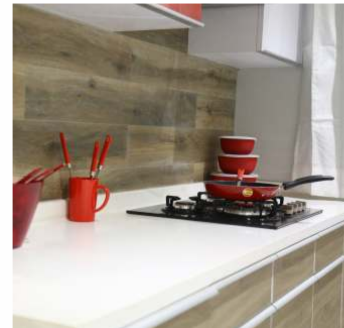
ACTUAL IMAGE OF SAMPLE APARTMENT